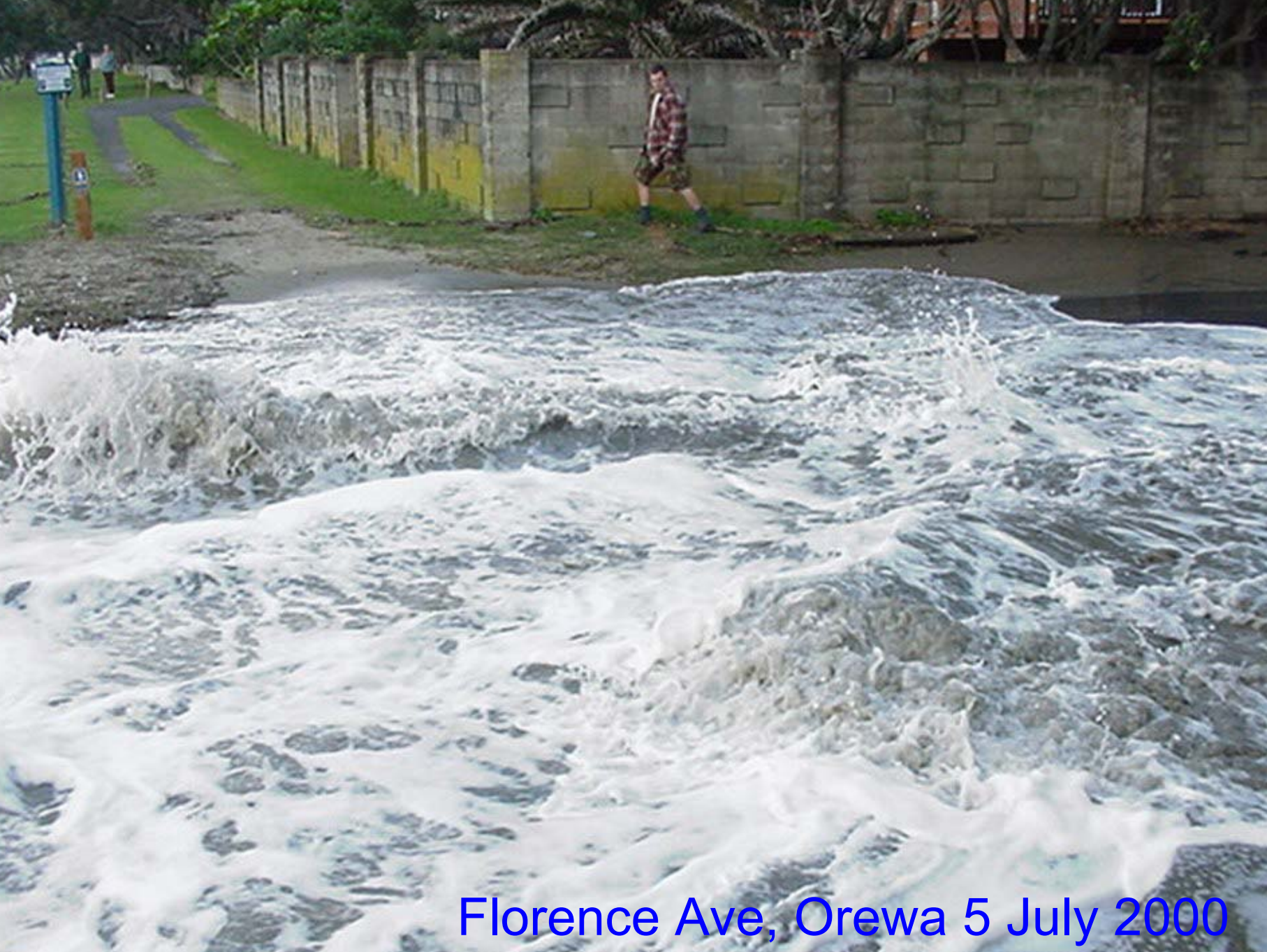
Florence Ave, Orewa 5 July 2000